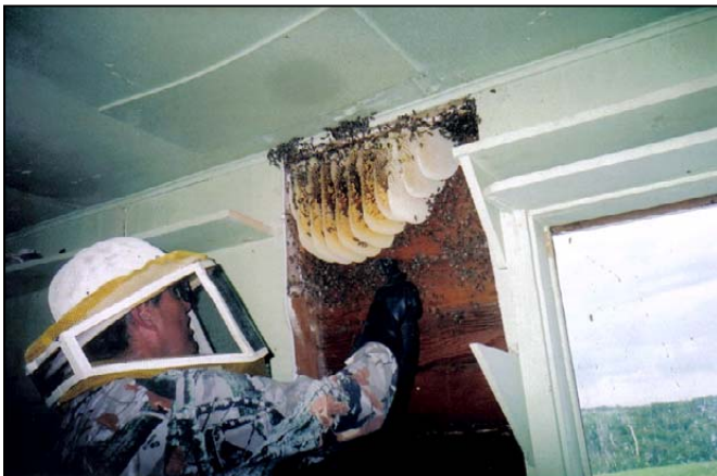
Bee removal in progress. The bees, inside a storage shed north of Osceola, IA, had constructed a nice set of combs.