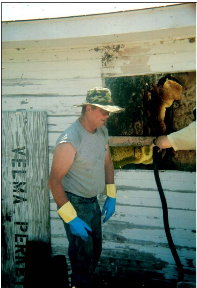
It appears the bees inside this barn west of Knoxville, IA had been quite busy building a wall of combs.