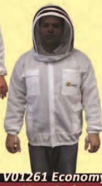
V01261 Economy Vent Jacket