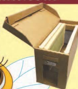
M01506 Nuc box Deep 9 5/8 and M01507 Medium 6 5/8" frame