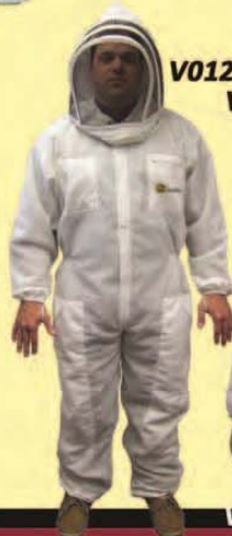
V01260 Economy Vent Suit