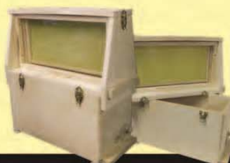
GS4006 Observation Hive