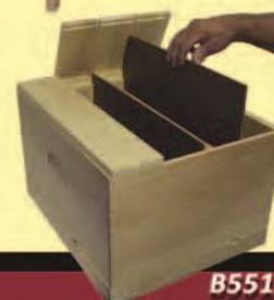
B55101 Queen Castle

51 S. 2 ND STREET, HAMILTON, IL 62341 217-847-3324 PH 217-847-3660 FAX TOLL-FREE (888) 922-1293 1318 11TH STREET, SIOUX CITY, IA 51102 712-255-3232 PH 712-255-3233 FAX TOLL-FREE (877) 732-3268