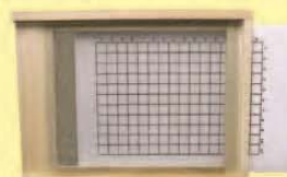
B92101 Screened IPM Bottom board