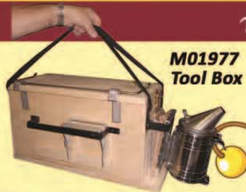
M01977 Tool Box