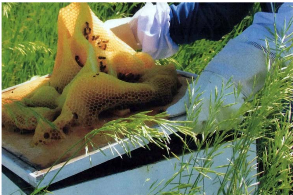
Sculpture created by bees inside an empty super from an inherited hive.