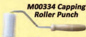
M00334 Capping Roller Punch