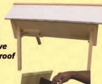
B52901 Topbar Hive with metal roof