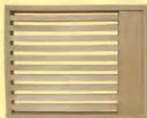
B91401 Slotted board