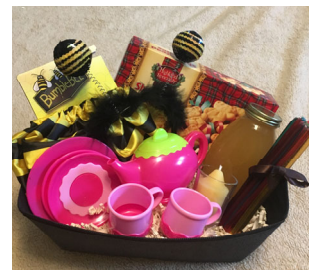
Baby Bees and Teas

Now please see how creative you can bee! Remember the interesting way the basket was made that we used when we invited all the legislators in the capitol last spring--the basket was a shallow box with a floor inserted and painted nicely. And the contents can range from foodstuffs to antiques to kitchen utensils to "found" items. People visit the contest site and set their minds on what they plan to bid on when we have the banquet. It's all great fun, and the IHPA queen program benefits!