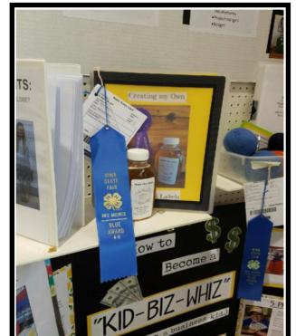
My project on designing labels won a blue at state