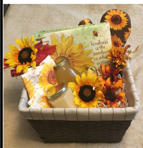
Cooking With Honey

Now please see how creative you can bee! Remember the interesting way the basket was made that we used when we invited all the legislators in the capitol last spring--the basket was a shallow box with a floor inserted and painted nicely. And the contents can range from foodstuffs to antiques to kitchen utensils to "found" items. People visit the contest site and set their minds on what they plan to bid on when we have the banquet. It's all great fun, and the IHPA queen program benefits!