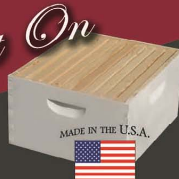
9-5/8 PAINTED HIVE BODY

COMES ASSEMBLED WITH 10 - 9-1/8" GROOVED TOP BAR FRAMES WITH BEESWAX COATED PLASTICELL FOUNDATION INSTALLED IN THE FRAMES. COMMERCIAL GRADE WOOD, PAINTED.