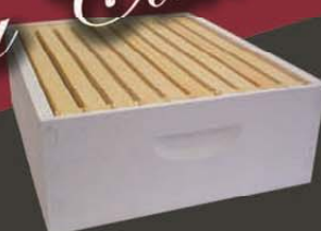
6-5/8 PAINTED SUPER

COMES ASSEMBLED WITH 10 - 6-1/4" GROOVED TOP BAR FRAMES WITH BEESWAX COATED PLASTICELL FOUNDATION INSTALLED IN THE FRAMES. COMMERCIAL GRADE WOOD, PAINTED.