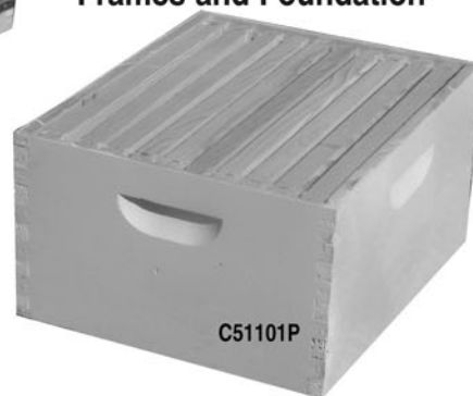
9 5/8 Painted Hive Body C51101P comes assembled with 10-9 1/8" Grooved top bar frames with beeswax coated Plasticell foundation installed in the frames. Commercial grade wood, painted. Ship Wt. 19 lbs. C51101P Carton of 1, ..... $49.95 ea. 20 or more ..... $46.95 ea.