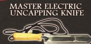
MASTER ELECTRIC UNCAPPING KNIFE