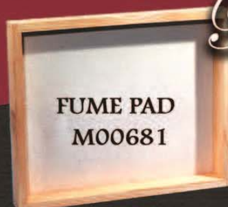
FUME PAD M00681

GRAB YOUR UNCAPPING PRODUCTS IN TIME FOR YOUR HONEY HARVESTING