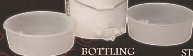
BOTTLING BUCKET KIT