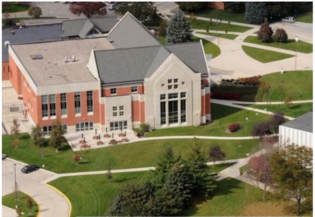
ABOVE: The Campus Center, Dordt College, Sioux Center