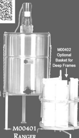
M00401 RANGER POWER EXTRACTOR