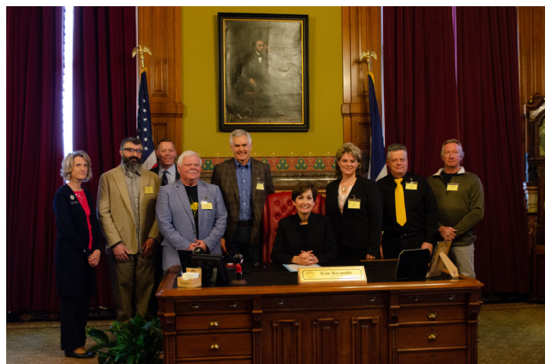
(right) The governor signs the official documents at Honey Bee Day, she is surrounded by Iowa beekeepers. _____,